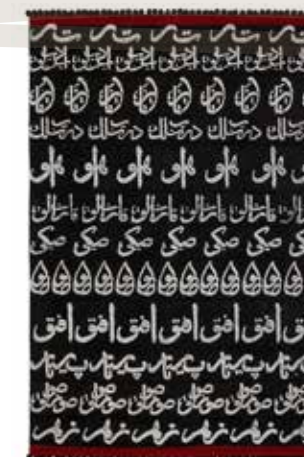
12 Words - 5306

Quality: Elements Linen, Viscose Pom Fringes Size: 170x240 cm Edition of 7, numbered and signed by the author