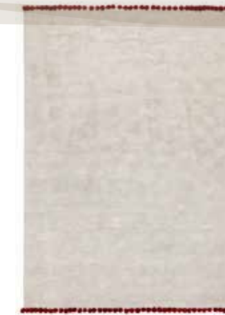
Bysantium - 5305

Quality: Select Wool & Viscose with Carving Size: 170x240 cm Edition of 7, numbered and signed by the author