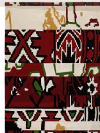
Istanbul - 5302

Quality: Select Wool & Viscose with Carving Size: 170x240 cm Edition of 7, numbered and signed by the author