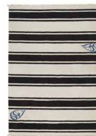
Peshtemal - 5307

Quality: Select Wool with Carving Size: 170x240 cm Edition of 7, numbered and signed by the author