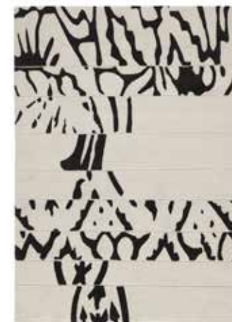
Hammam - 5304

Quality: Select Wool & Viscose with Carving Size: 170x240 cm Edition of 7, numbered and signed by the author