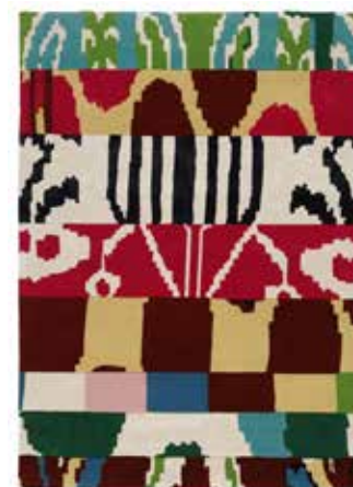
Green Ikat - 5303

Quality: Select Wool, Viscose Pom Fringes Relief and Carving Size: 200x300 cm Edition of 5, numbered and signed by the author