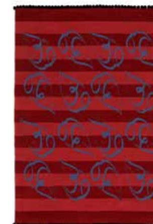
Water - 5308

Quality: Select Wool, Viscose Pom Fringes Size: 170x240 cm Edition of 7, numbered and signed by the author